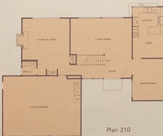
FIRST FLOOR Shown Reversed

Westlake Village reserves the right to alter price, product or design without notice or obligation.